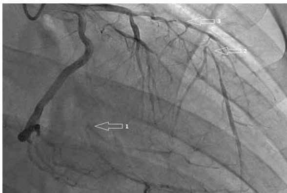
Fig. 2. Right anterior oblique view of the left coronary artery showing occluded (1) first obtuse marginal artery and (2) left anterior descending artery with retrograde collateral supply, and (3) critical stenosis of the diagonal branch.