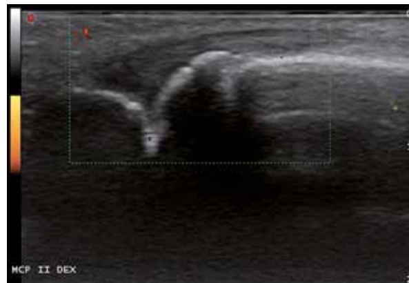
Fig. 2. MCP II joint without synovitis in patient with rheumatoid arthritis.