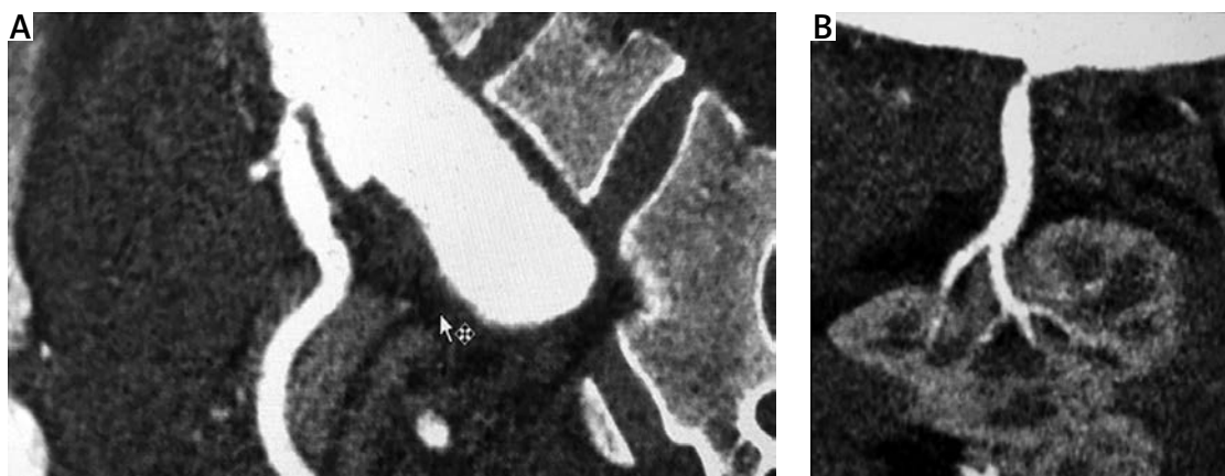
Fig. 2. Abdominal angio-CT showing superior mesenteric and renal arteries stenoses.