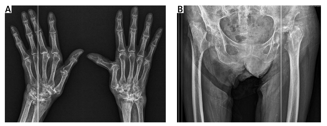
Fig. 2. A ) Rheumatoid hands showing periarticular osteoporosis, erosions, ulnar deviation of the fingers of the right hand with subluxation of the 2<sup>nd</sup> and 3<sup>rd</sup> metacarpophalangeal (MCP) joints, and the 1<sup>st</sup> MCP of the right and left hand, respectively. B ) Hip radiography indicated the absence of the head and cervix of the femur with cranial deviation of the metaphysis bilaterally