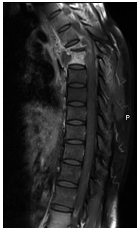
Fig. 2. Pott's disease of T7–T8 spondylodiscitis complicated by spinal cord compression with intraductal abscess.

According to our knowledge, this study is the first to focus on the epidemiology and analysis of factors associated with NTSCI in a rheumatology department in Burkina Faso. The NTSCIs are relatively less frequent in our context compared to those commonly described in Western literature, where the incidence ranges from 20 to 68 cases per million inhabitants per year [4]. However, the data found in our series are similar to those from other studies conducted in African populations, with hospital frequencies between 0.6% and 3% [5, 6]. The lower frequency of NTSCI in our study compared to high-incidence Western studies can be attributed to several factors. First, it is possible that the diagnosis of spinal compressions is less frequent due to the multi-disciplinary nature of spinal compression management, where most patients are admitted to various medical and surgical specialties. Consequently, our study, con-