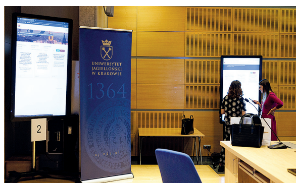
Fig. 6. Poster presentations.