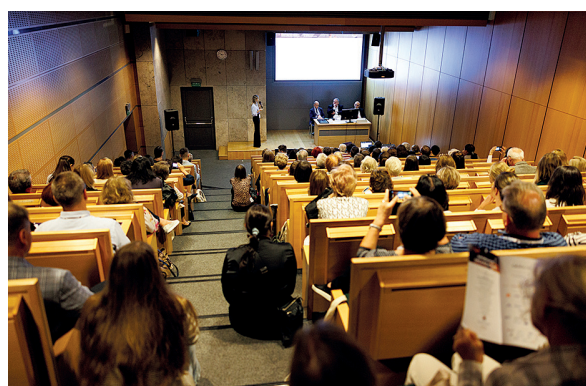
Fig. 4. Presentation of abstracts.