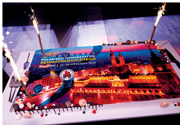
Fig. 3. The jubilee cake.