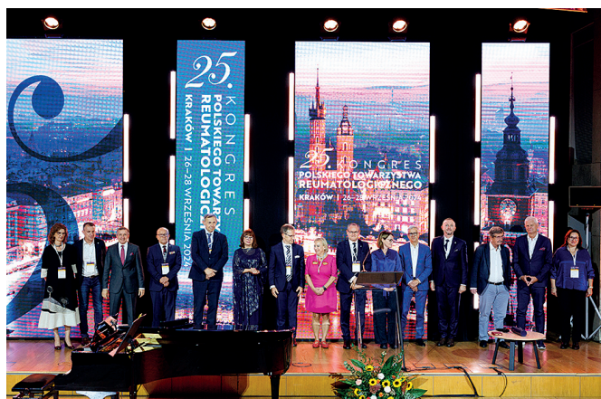
Fig. 1. Inauguration.