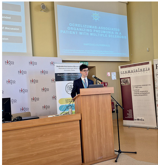
Fig. 3. The Head of the Organising Committee introduces the speaker.