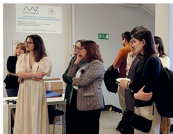
Fig. 2. The poster walk caught everyone's attention.