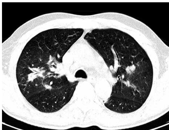
Fig. 3. Intravenous contrast-enhanced chest CT image: infiltrates and nodules of both lungs.