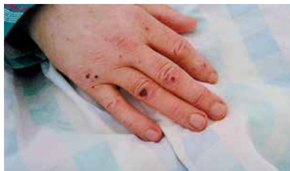
Fig. 2. Maculopapular rash of the palm.

The levels of immunoglobulin (IgG, IgA, IgM, IgE) and C3 and C4 components of complement remained normal.