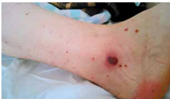
Fig. 1. Maculopapular rash of the lower limb.