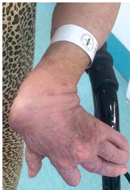
Fig. 2. Hand deformities make difficult using a walking frame and increase the risk of fall in a rheumatic patient at geriatric age after surgical procedures on lower limb joints.

Rheumatic patients frequently use orthopaedic equipment – crutches, walking frames, orthopaedic shoes, shoes supporting the forefoot, orthopaedic collars, stabilizers, corsets. A rheumatic patient, walking with crutches after a surgical operation on the lower limb joints, usually falls in a very characteristic way (Fig. 4).