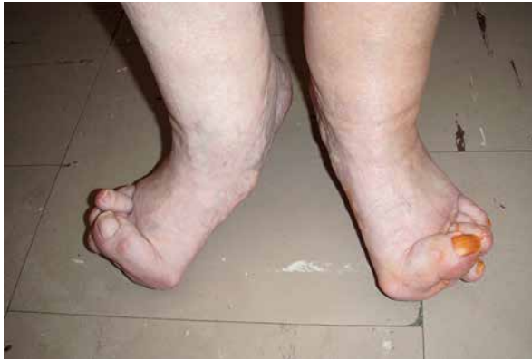
Fig. 3. Feet deformities in the course of RA making difficult wearing shoes and normal walking.