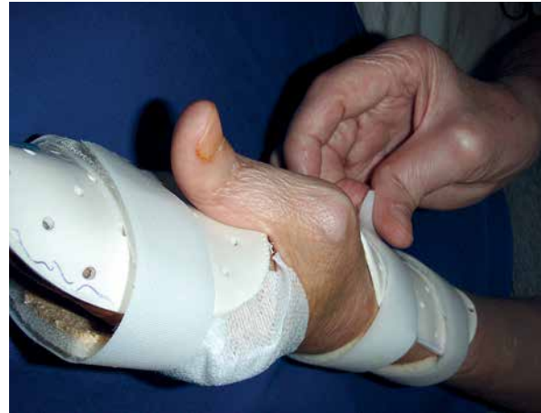
Fig. 4. Hand orthoses, worn by a patient after hand surgery also can worsen the situation during falling.

Unfortunately, training in falling techniques is contraindicated in that group of patients – although such physiotherapeutic procedure is available. Therefore, we strive to minimise the risk, since we cannot teach how to fall safely, in a controlled way.