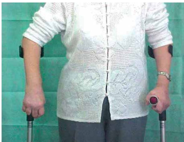
Fig. 1. Characteristic mode of holding crutches by a patient with hand deformities in the course of rheumatoid arthritis, increasing the risk of falls.

osteoarthritis). A falling patient has no “better side” without an endoprosthesis and always falls on a joint operated on.