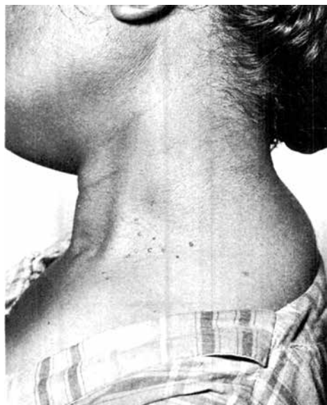
Fig. 6. Residual pigmented lesions seven years after nuclear fallout beta burn [13]. (This image is a work of a United States Department of Energy [or predecessor organization] employee, taken or made as part of that person's official duties. As a work of the U.S. federal government, the image is in the public domain.)

The closest approximation of RSV-related beta burns was observed following detonation of the Castle Bravo thermonuclear device in 1954 on Bikini atoll, when high winds carried nuclear fallout to inhabited parts of