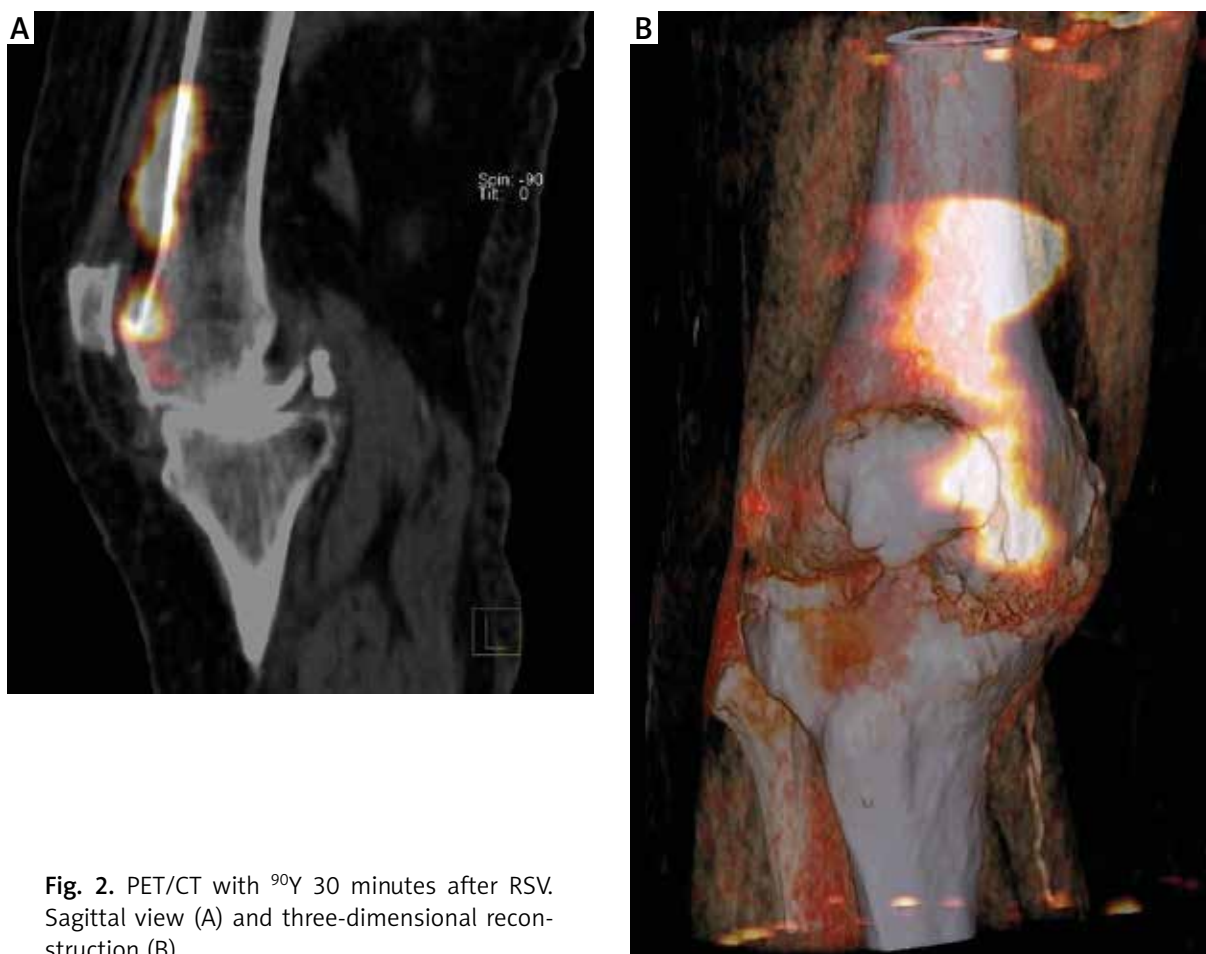
Fig. 2. PET/CT with ^{90}\text{Y} 30 minutes after RSV. Sagittal view (A) and three-dimensional reconstruction (B).

tial radiopharmaceutical reflux along the needle tract into the subcutaneous tissue.