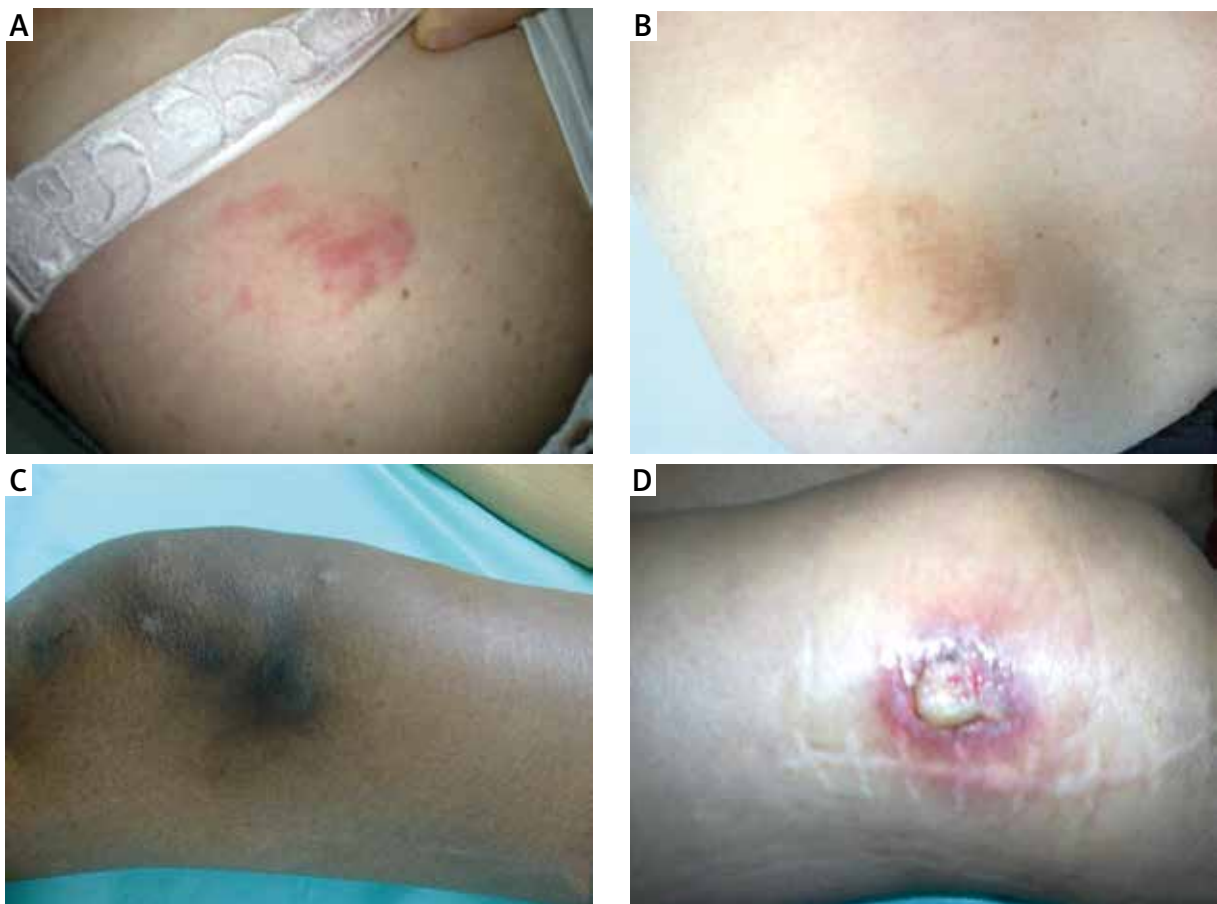
Fig. 4. Beta burns one week (A) and two weeks (B) after shoulder joint RSV with ^{186}\text{Re} . Injection site skin discoloration one year after ^{90}\text{Y} knee RSV (C). Superficial skin necrosis six weeks after ^{90}\text{Y} knee RSV (D).